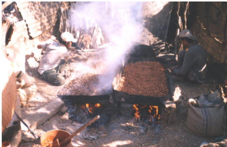
Photo 6: Men are roasting peanuts after the red color was added to the shells