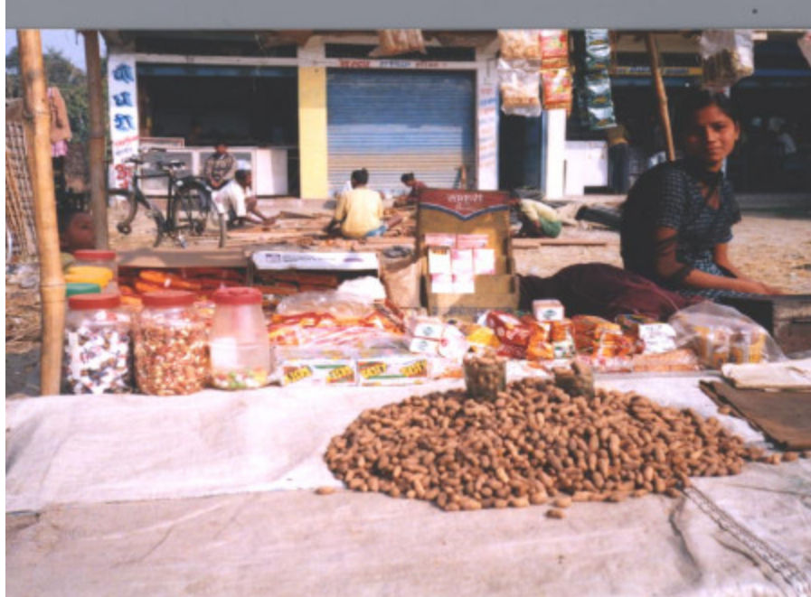
Photo 1: Small shops by the roadside sell peanuts along with other snack-food items