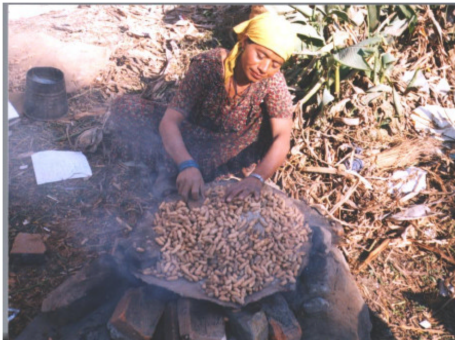
Photo 3: A woman is roasting peanuts. She would use the tin container as a measure to sell peanuts