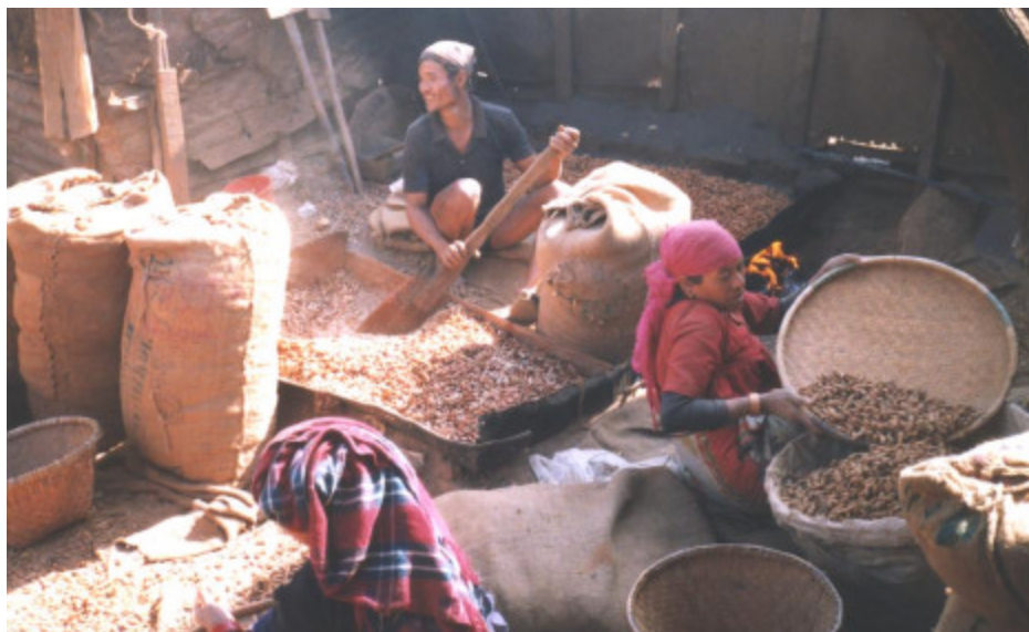
Photo 4: Men and women are sorting and mixing peanuts at a processing unit in Kathmandu