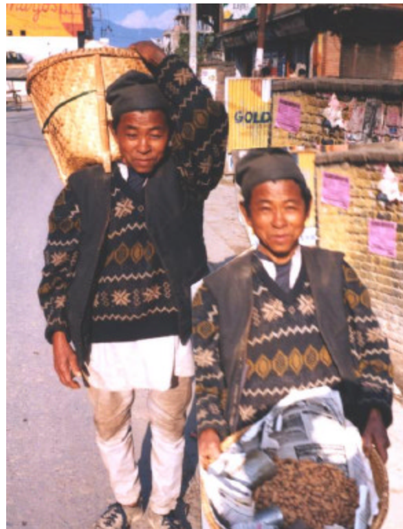
Photo 2: Some hawkers carry peanuts in Dalo (bamboo basket) and visit public places in order to reach the consumers