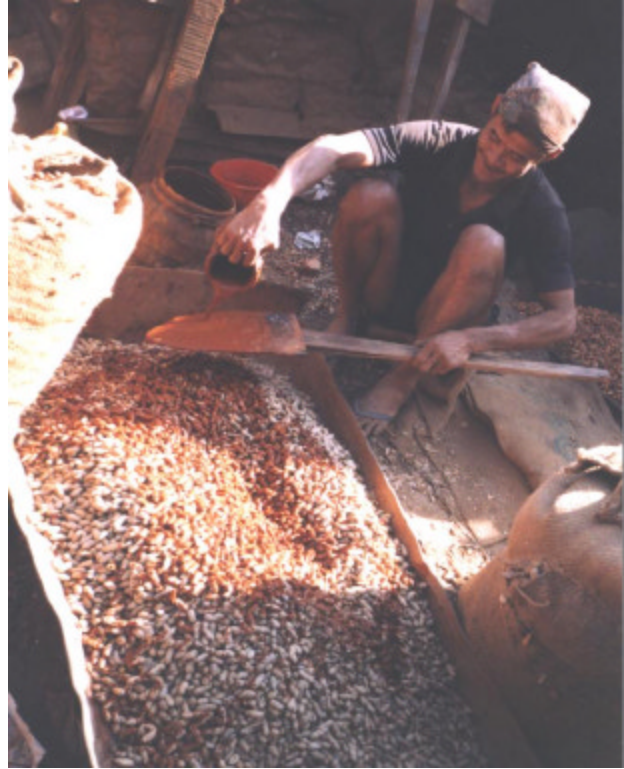
Photo 5: Red clay is used to color peanuts from Tarai to obtain Kanchi badam 's appearance